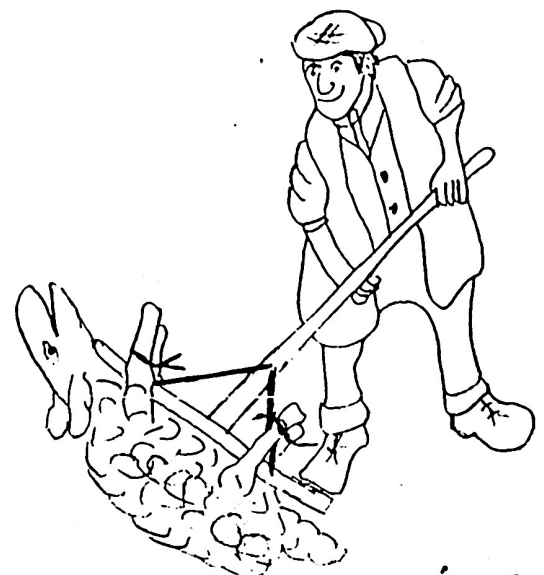
CLEANING THE ICE (AT GREENACRES)

The semi finals and final are to be held at Kinross on Tuesday 16th January.